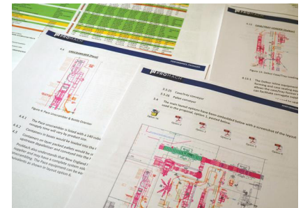
F-EES Deliverables are Customer Specified for Each Project